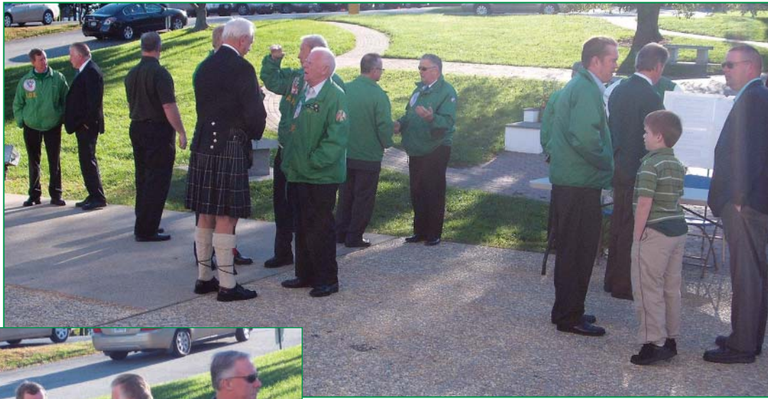
Hibernians meet and greet before Holy Mass