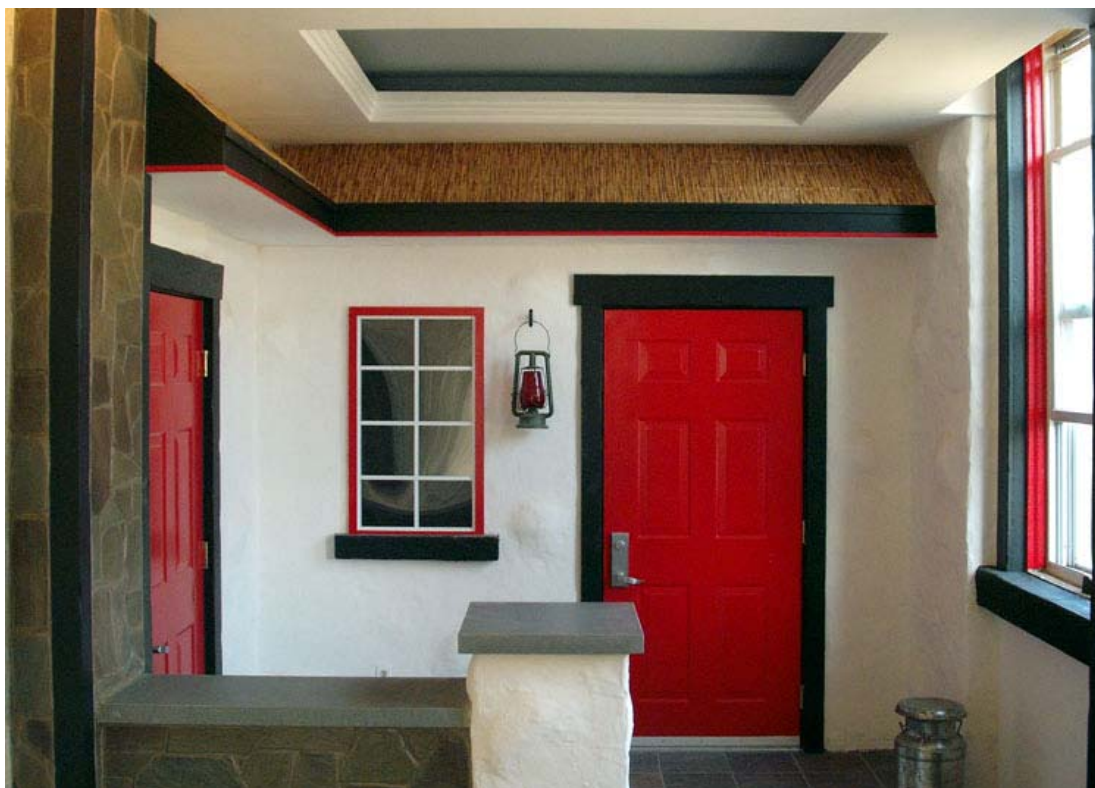
The Entrance to the Hall.

If you haven't seen our new entrance way ... it has been too long. Stop by the Hall for a visit.