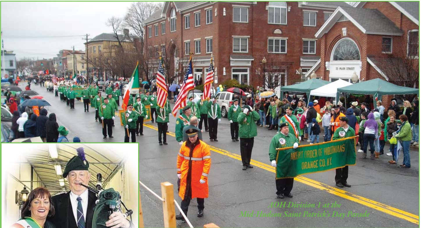
AOH Division 1 at the Mid-Hudson Saint Patrick's Day Parade