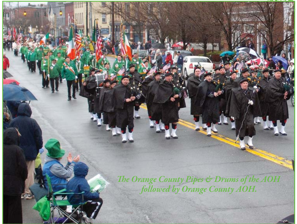
The Orange County Pipes & Drums of the AOH followed by Orange County AOH.